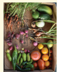
There's always something productive to do at TMWC