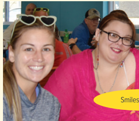
Smiles all around