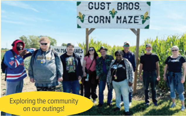
Exploring the community on our outings!