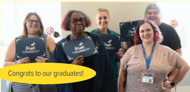
Congrats to our graduates!