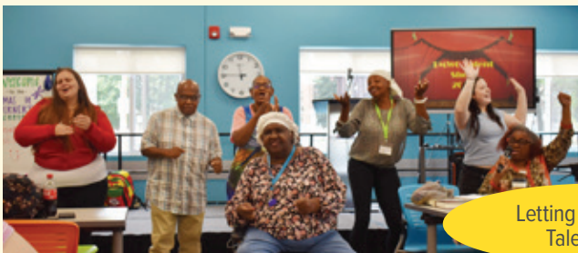
Letting loose at the Talent Show