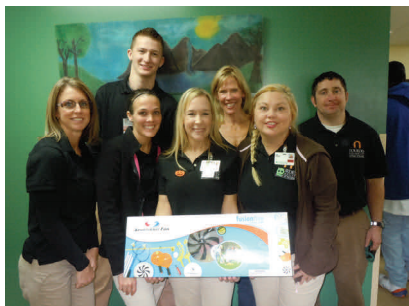
Nursing students from Lourdes University presented the Center with a gift upon completing their stay here. Thank you Lourdes University students! You're great!