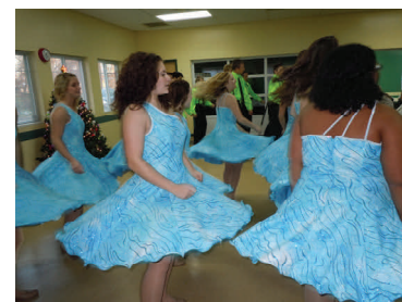
The Bedford High School Soiree, below, swirling about as they sing holiday tunes!